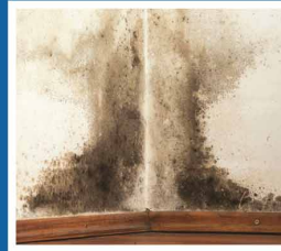
Toxic Black Mold Removal